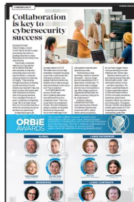
1/2 page ad