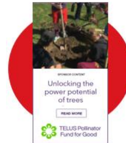
Digital Integrated Special Report Content Discovery - Standard Digital Traffic Driver.

Advertising commitment includes quote/mention in one article