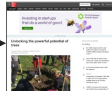
Digital Integrated Special Report Ads rotate with equal SOV among participating advertisers. Includes brand mention within report.