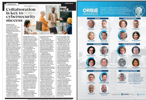
Full page ad