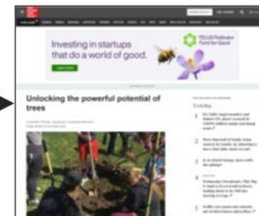
Digital Integrated Special Report Ads rotate with equal SOV among participating advertisers. Includes brand mention within report.