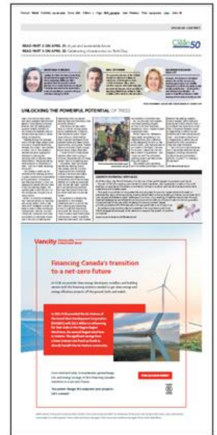
Print Integrated Special Report with brand ad adjacency and brand mention within report.