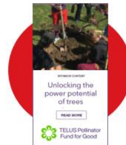
Digital Integrated Special Report Content Discovery - Standard Digital Traffic Driver.

Advertising commitment includes quote/mention in one article