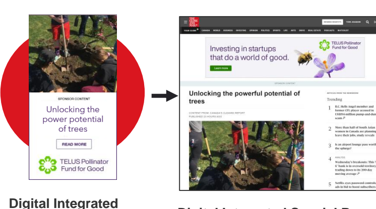
Special Report Content Discovery -Standard Digital Traffic Driver.

Your brand mentioned within the integrated report among participating advertisers