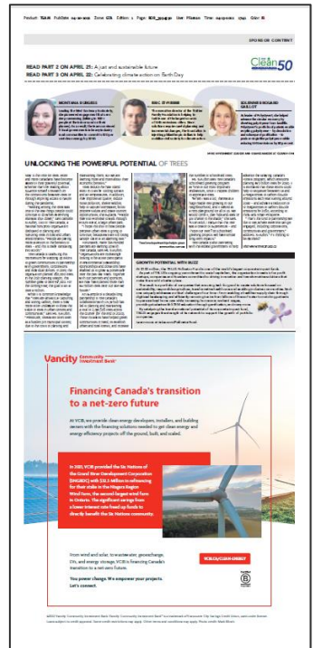
Print Integrated Special Report with brand ad adjacency and brand mention within report.