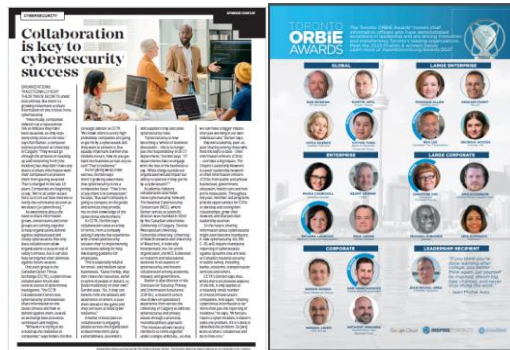
Full page ad