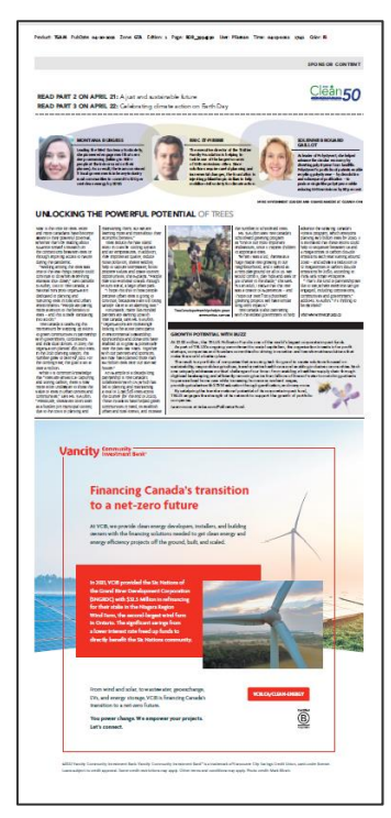
Print Integrated Special Report with brand ad adjacency and brand mention within report.