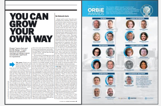
Full page ad