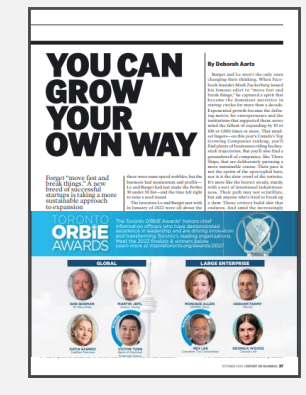
½ page ad