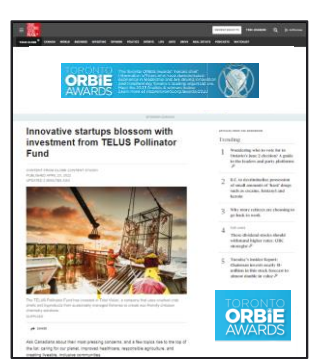
Digital Sponsor Content Custom developed with the client